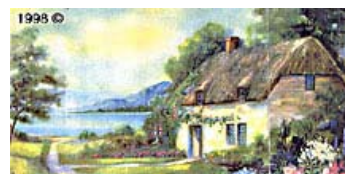
image onto your polyester fabric and it dyes the fabric, so it is a soft image which can be embellished with silk ribbon if desired.